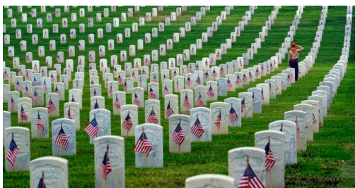
Celebrate Memorial Day on May 29