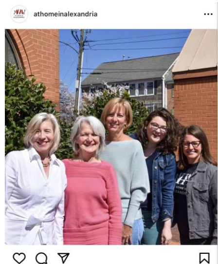
Photo above is screenshot of AHA’s first Instagram post. Instagram is a social media site that allows quick updates about people and events. Following was the first post:

Meet the staff for At Home in Alexandria - Your Alexandria "Village." We help to provide valuable functional, social, and emotional support to seniors in our community who wish to continue to live independently.