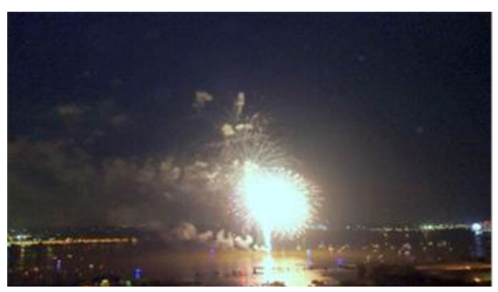
A bright burst lights the river (above); the tiny specks in the water are the many boats that gathered to get a close view.