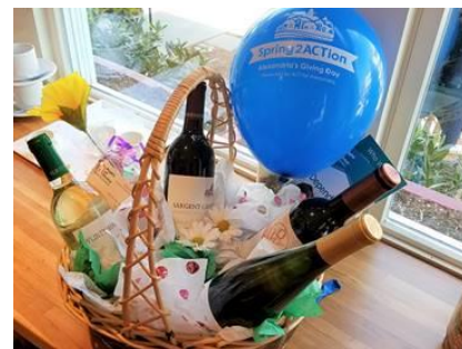
Wine Basket Raffle