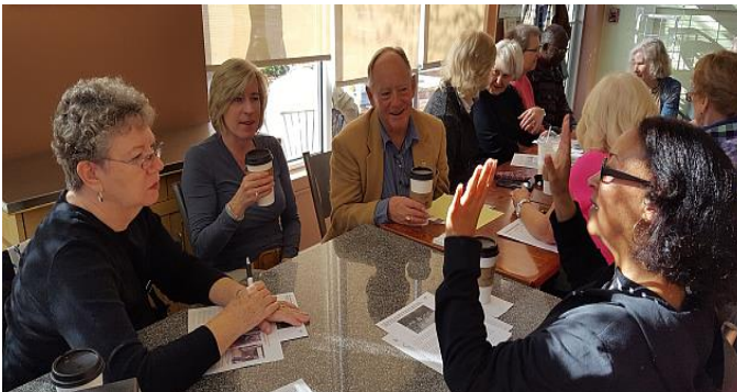
Attendees at the coffee gathering in Cameron Station.