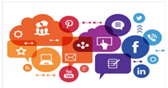
Information technology and social media

Channeling part of “The Twelve Days of Christmas,” he said he had “four deviled eggs, three lamb chops, two sliced cukes, and a non-alcoholic bev-rage.”