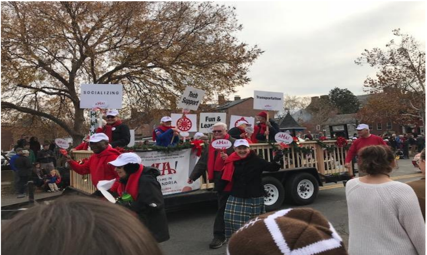
Riders on AHA’s float in the Scottish Walk Parade hold signs advertising the various services AHA provides.