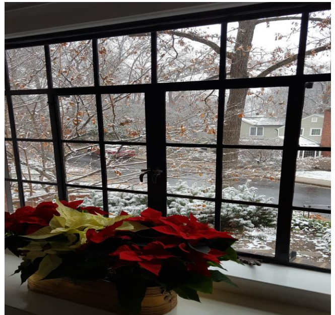
The first (light) snow of winter, making a Beverley Hills neighborhood lovely with a light dusting.