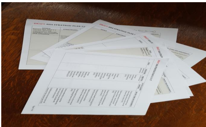
AHA's planning document is available online.

YOU can make a difference in the lives of members by volunteering your time and suggesting ways we can better serve you. If you have suggestions for new programs or services, please let the office know. The board would love to know what you think and how we are doing. In addition, we always need more drivers, and new leaders for interest groups. Free space for events and meetings is also a need as we plan ahead. Please join us in this expanding vision for a vibrant organization that serves YOU!