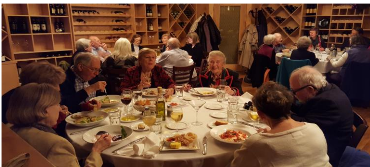
The holiday dinner at A La Lucia is an AHA tradition.